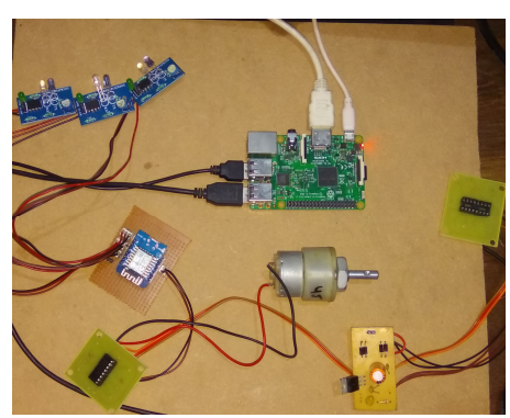
Fig2:- hardware of proposed system