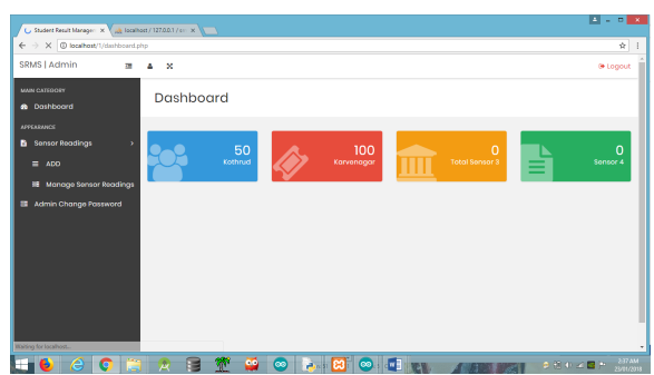
Fig4:- webpage displays condition of dustbin

Above result shows the interfacing of different hardware like IR sensors, motor, Wemos d1 mini, mouse and keyboard with Raspberry pi and the OS of Raspberry is, as shown in fig., running on the monitor.