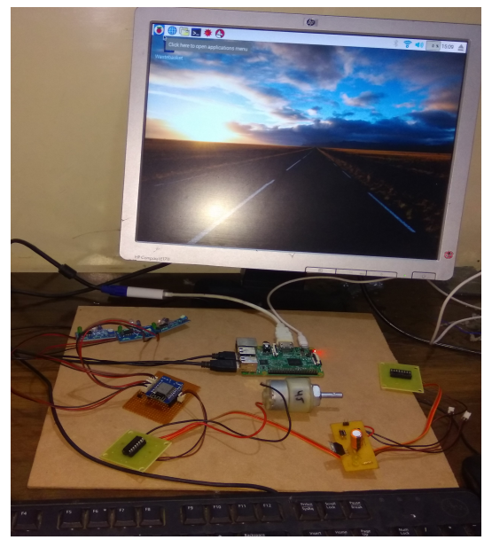
Fig2:- Proposed system.